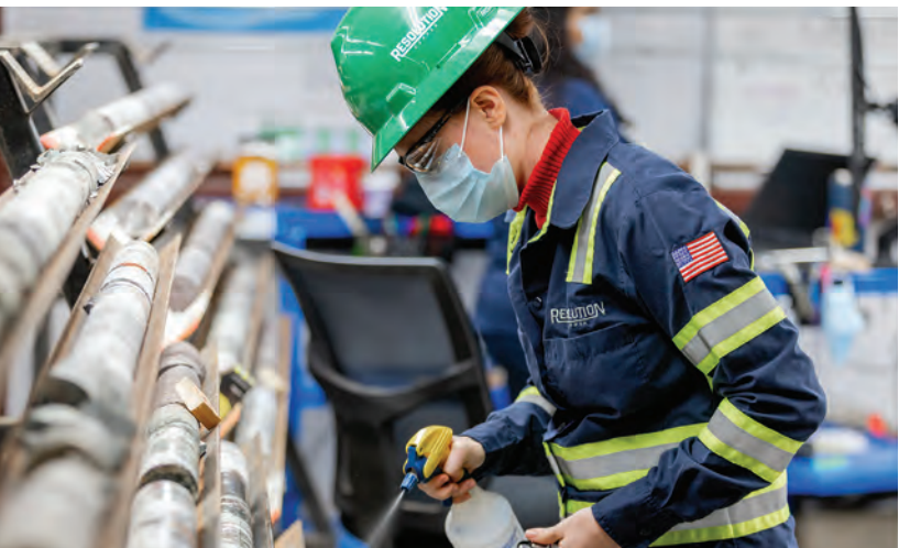
Left top: Major Drilling Contractors working in the Resolution Copper mine at the East Plant site, AZ.

Resolution Copper is proud of the fact that 87% of our workforce lives within 40 miles of the mine. We're invested in this community's future and committed to building one of the most modern and sustainable copper mines in the world, ensuring Arizona resources and Arizona workers power America's clean energy economy.