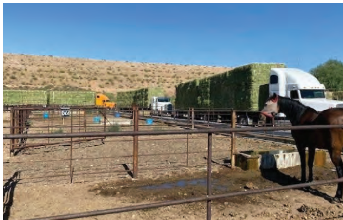
Resolution Copper partnered with the Gila County Cattle Growers Association to provide support for ranchers impacted by wildfires.