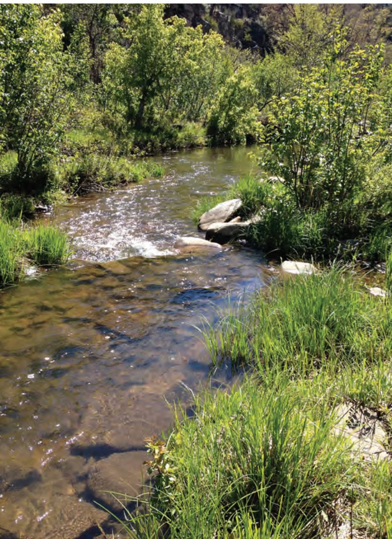
Resolution Copper private lands to be transferred to the U.S. Government in the land exchange. East Clear Creek is located within the Coconino National Forest.

Water conservation is something we take very seriously because we live and work here too.