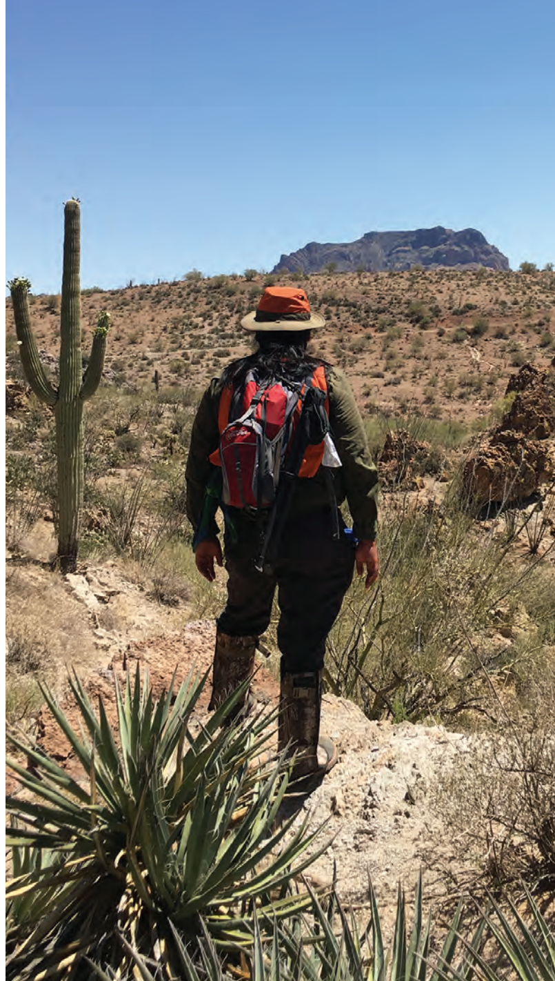
Tribal Monitor surveying Arizona landscape for Native American artifacts.

For more information regarding the consultation process, visit www.resolutionmineeis.us