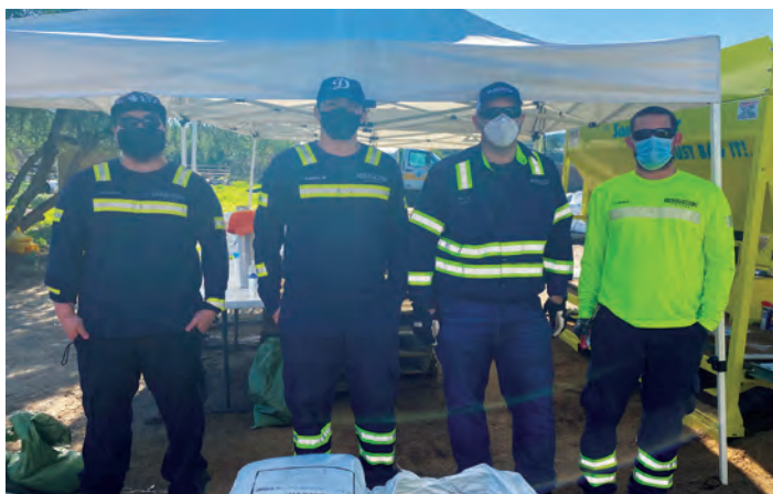
Resolution Copper employees support Gila County's flash flood response by filling sandbags.

In addition, Resolution Copper coordinated clean-up efforts with local contractors and provided essential geographic system information to the US Forest Service to carry out controlled back burns to protect the Oak Flat campground and Emory Oak groves.