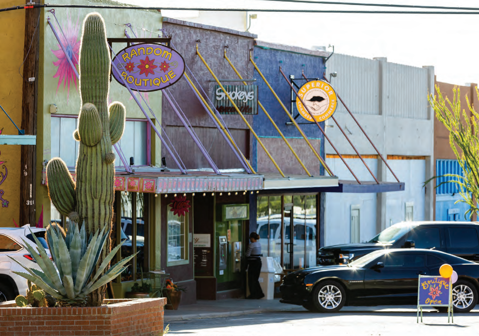
Main Street, Superior, AZ.