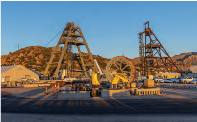
Resolution Copper mine, East Plant site, AZ.