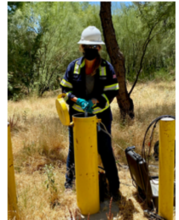
Resolution Copper employees and Community Monitoring Group member collect groundwater and surface water samples.