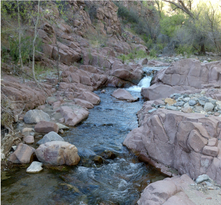
Lower Mineral Creek at Government Springs Ranch, located southwest of Globe, Arizona.

Resolution Copper is permitting one of the world's largest untapped copper deposits in Arizona's Copper Triangle. Once in operation, the mine could supply up to one-quarter of the nation's copper demand, providing a vital resource for America's clean energy transformation.