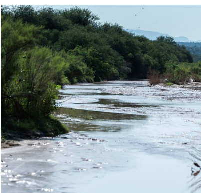
The 7B Ranch parcel is located primarily on the eastern side of the lower San Pedro River and east of Mammoth, Arizona.

Through a proposed land exchange, Resolution Copper would deliver 5,459 acres of privately-held land to the government for conservation, including areas that are home to endangered species and rich riparian wildlife. The Lower San Pedro River parcel, the largest of all the land parcels in the exchange, has an ecosystem noted by the Nature Conservancy as one of the "Last Greatest Places on Earth" and has earned the distinction of "Important Bird Area" from prominent bird groups. Transferring these lands into public hands will enable the government to prioritize conservation efforts and protect vulnerable habitats of threatened and endangered aquatic creatures, while preserving miles of creeks and rivers in their entirety.